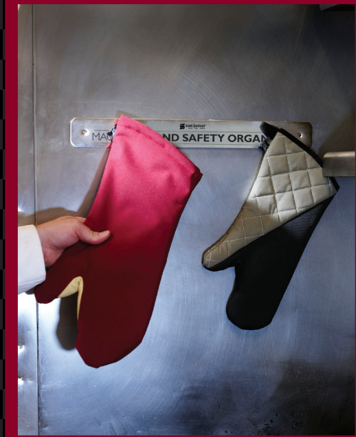
Use the magnet or additional loop for easy storage.