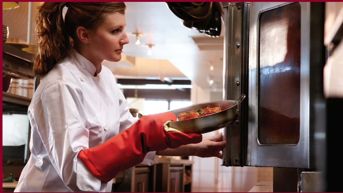
Cool Touch™ oven mitts are cost effective, easy to care for and PI49 Class I NSF certified. Made in the U.S.A.