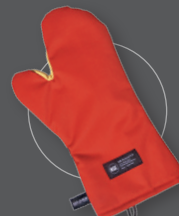
Cool Touch™ Oven Mitt